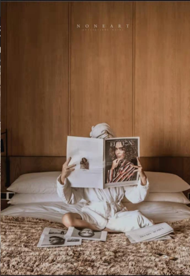
上海拍照 | 随手拍都是INS大片的艾迪逊酒店